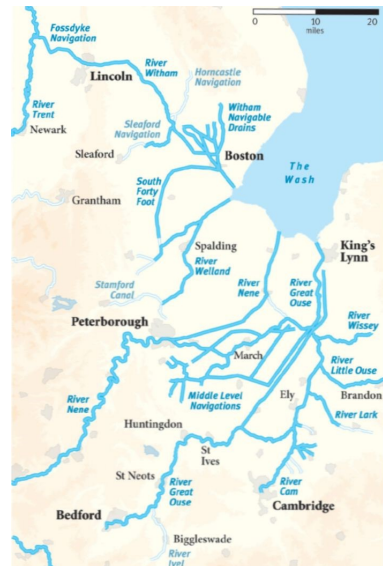
A map showing the waterways in The Fens.